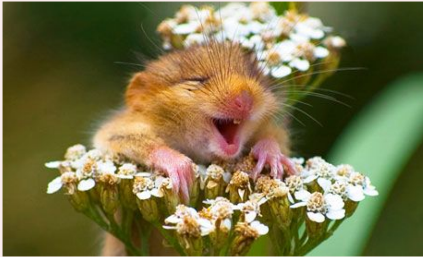
Field mouse enjoying flowers.