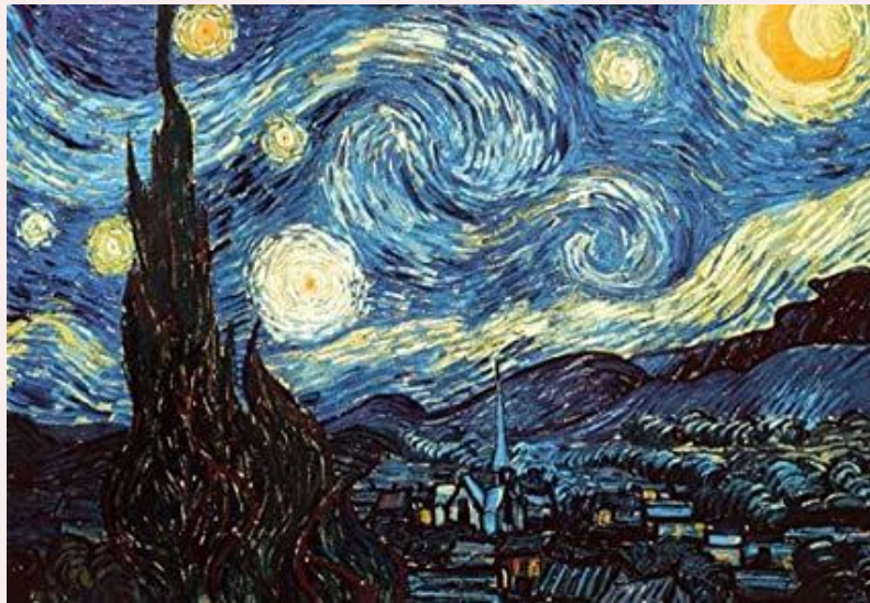
Van Gogh, Vincent. The Starry Night