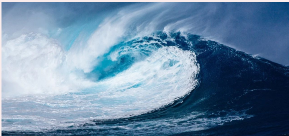
Oceans and other bodies of water!

Nature is everything in the world that is natural and NOT made by humans! Here are some things that are included in nature!