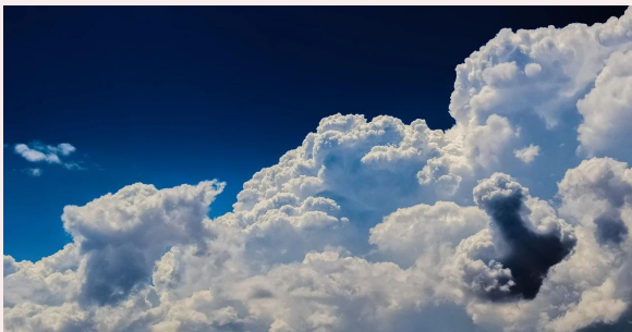
Clouds and weather patterns!