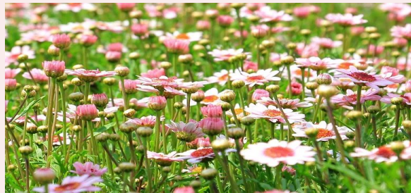
Flowers, plants, and trees!