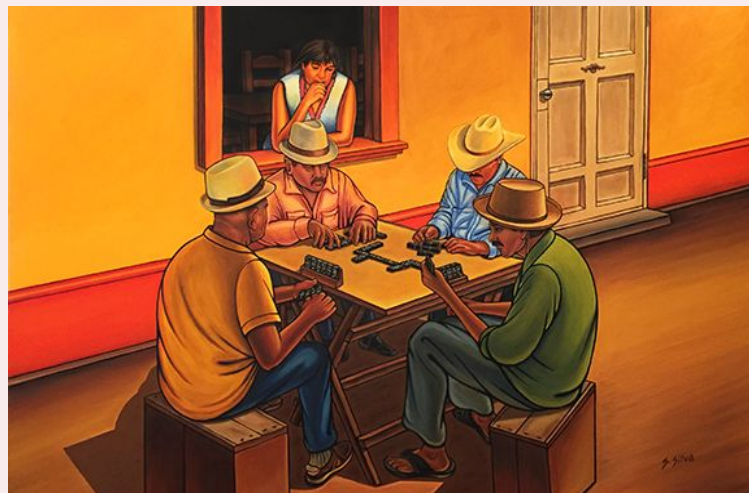
Silva, Simón. Untitled.